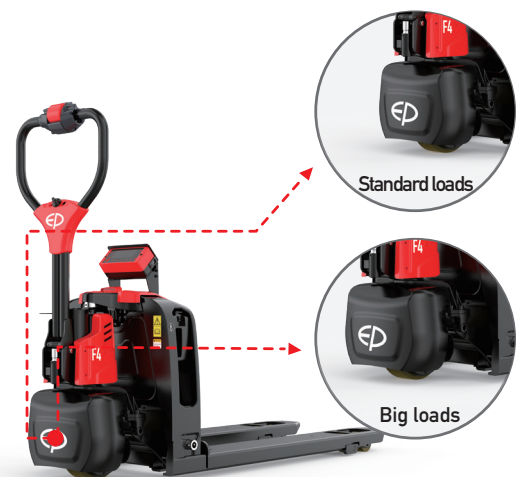
Stabilizing wheel option